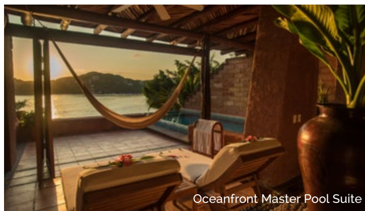
Oceanfront Master Pool Suite